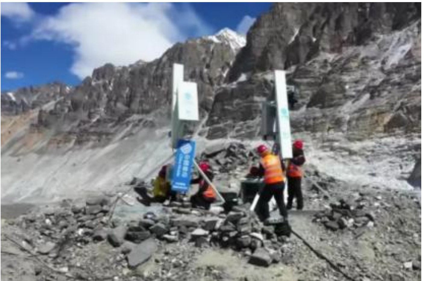
Huawei has installed the 5G masts on Everest, providing internet speeds much faster than the average in Britain

Furtenbach Adventures runs “flash” expeditions, reaching Everest’s summit in four weeks rather than the normal eight, with the help of at-home acclimatisation exercises and supplementary oxygen.