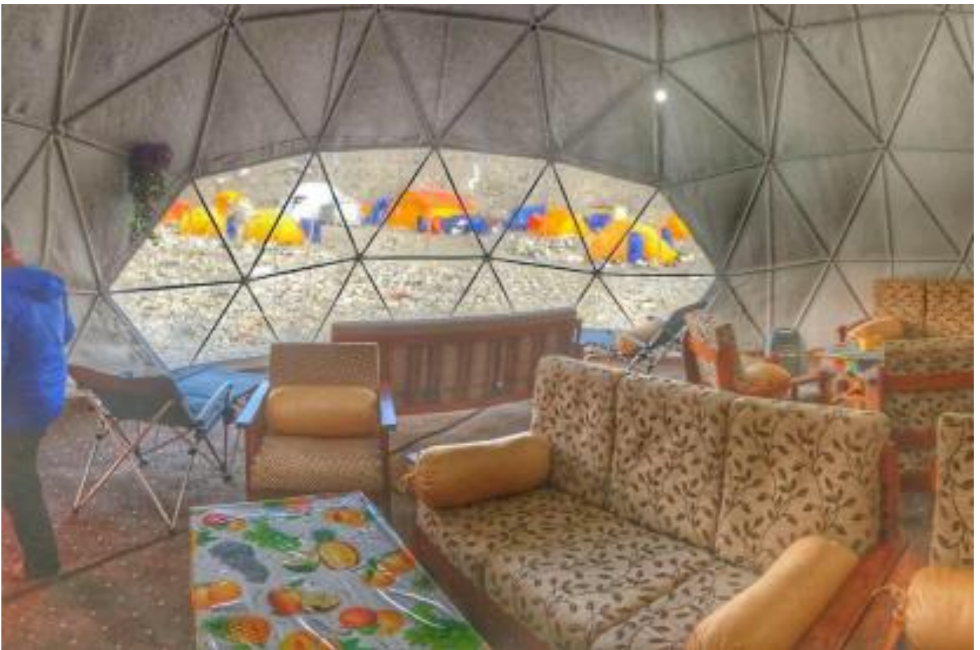
Furtenbach Adventures is one of many companies offering climbers some home comforts FURTENBACH ADVENTURES

As more and more people flock to the “death zone” above 8,000m (26,250ft), there are more demands for creature comforts. And internet coverage on the summit is the latest feature to be installed. China Mobile and Huawei have installed three 5G masts on Everest and is adding a fourth. They offer speeds of up to one gigabit per second, much faster than the average home broadband speed in the UK.